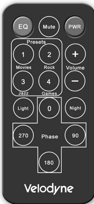
Figure 3. Remote Control

NOTE: The Optimum remote can be attached magnetically to the back of the subwoofer in the upper left hand corner.